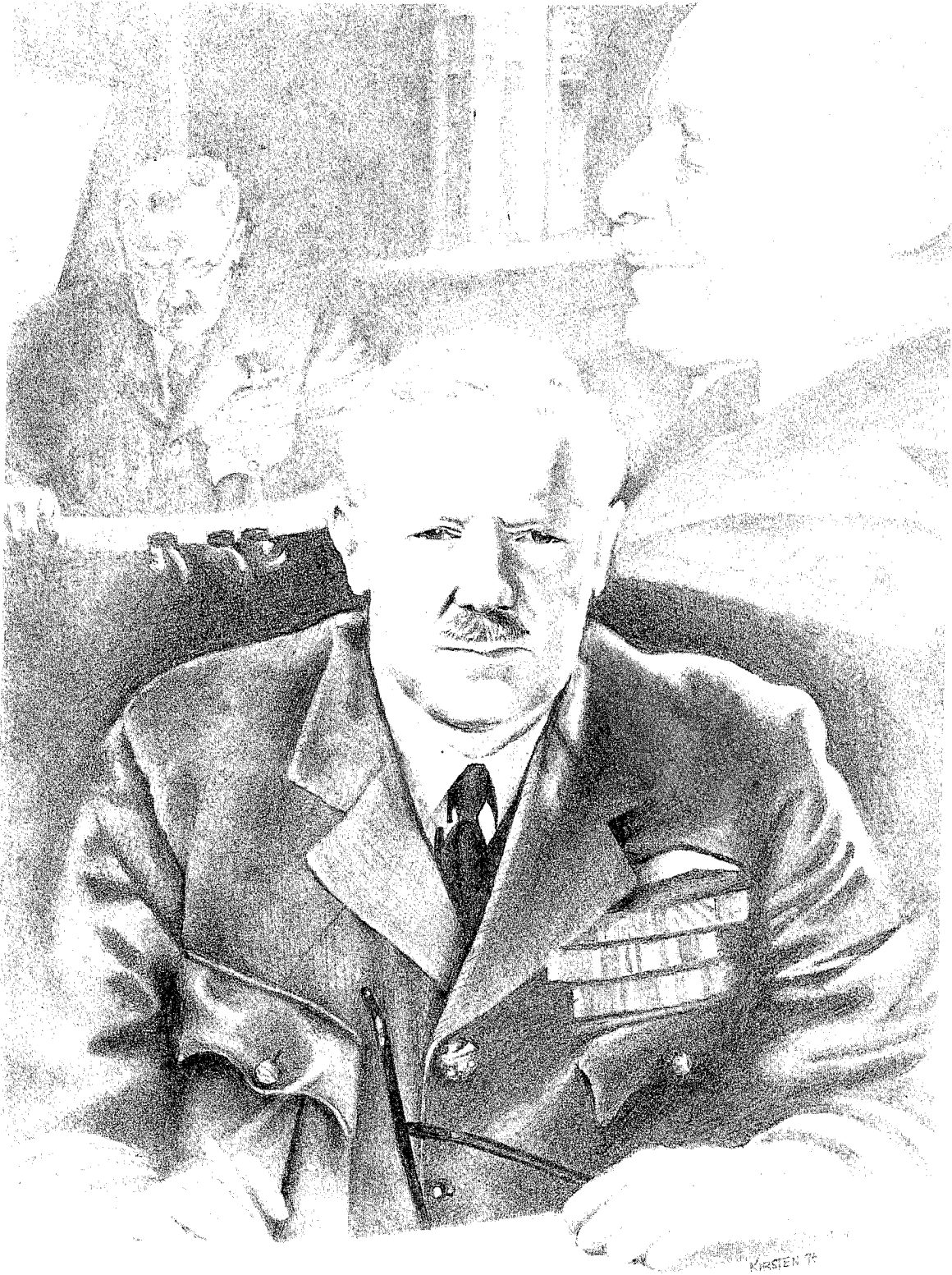
Air Marshal Sir Arthur Harris